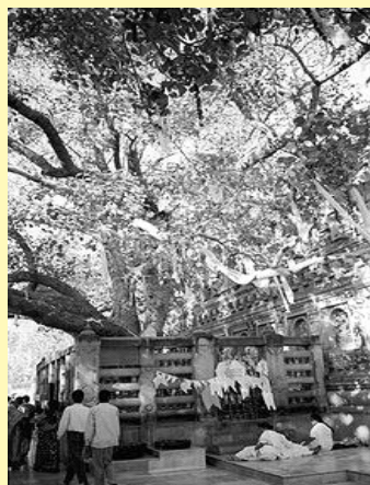
The Bodhi Tree at the Sri Mahabodhi Temple

It takes 100 years to 3000 years for a bodhi tree to grow fully.